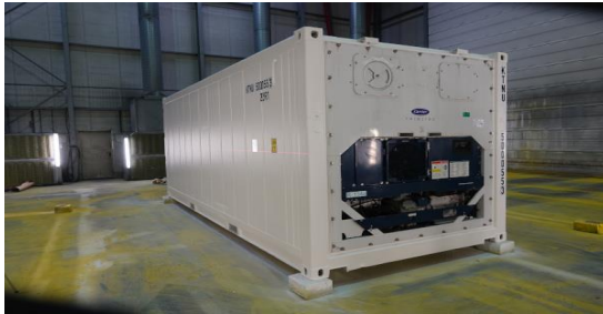
40' M.G.S.S. Hi-Cube Refrigerated Container